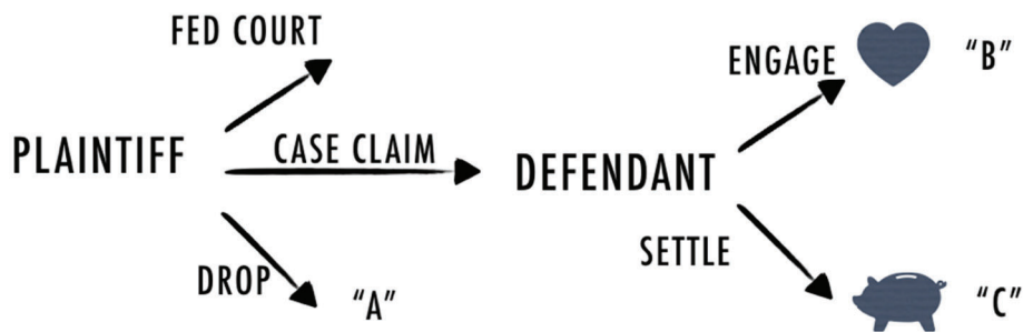
Figure 1: Addition of Small Claims Trajectory

A small claims tribunal, such as envisioned by the CASE Act, opens a different avenue to prospective plaintiffs. As an alternative to the federal court system, the plaintiff can elect to have the dispute brought before the small claims tribunal.